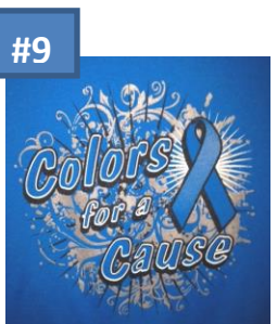
Sapphire w/front design