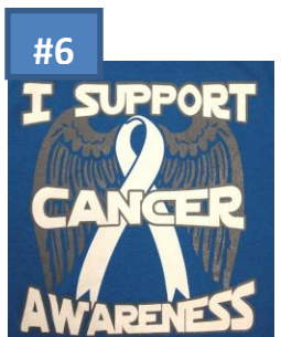
Sapphire Blue/White Lung