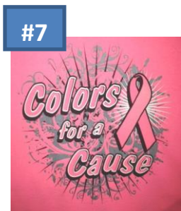
Safety pink w/front design