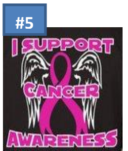
Black/Hot Pink - Breast