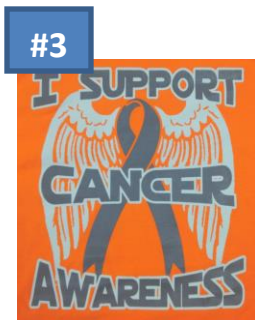
Safety Orange/Gray Brain